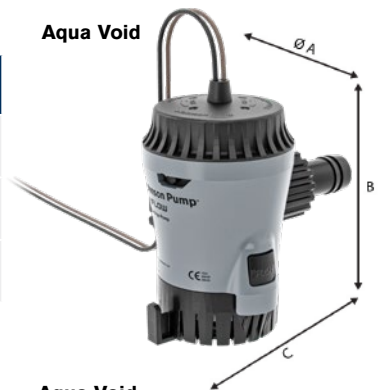
Aqua Void Automatic Ultima Combo