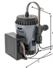
Aqua Void Automatic-Electro-Magnetic Combo